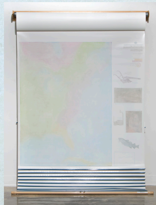
The Country in Flames (map component), 2017 Pull-down maps, granite, colored dust