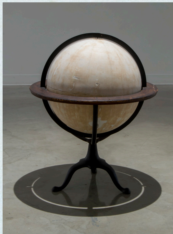
Untitled (1927 World Globe), 2019 Hand-sanded vintage globe with metal and wood stand

agustinawoodgate.com masonexhibitions.org art.gmu.edu